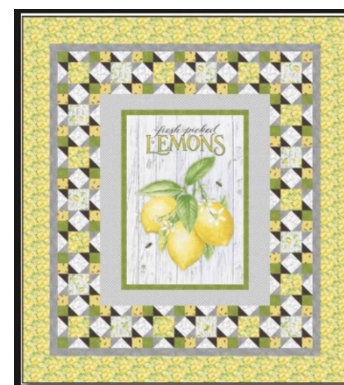
June is National Lemon Month